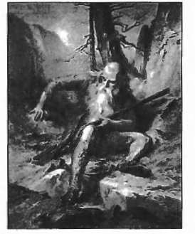
Rip van Winkle as imagined by the contemporary American painter George F. Bensell