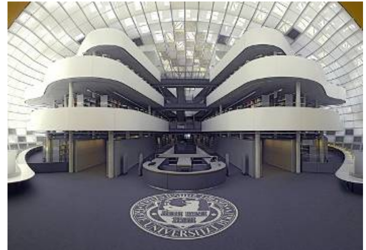
Philological Library, 2005