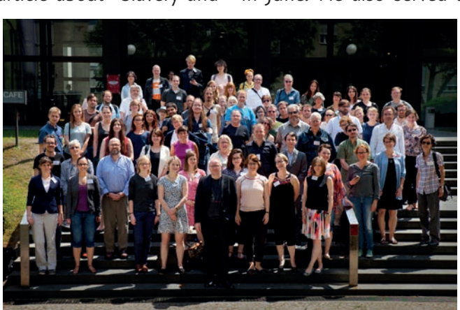
PARTICIPANTS OF THE FINAL POPULAR SERIALITY CONFERENCE

Department of American Studies at Brown University.